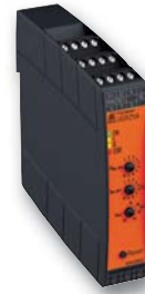
Smart motorstarter UG 9256