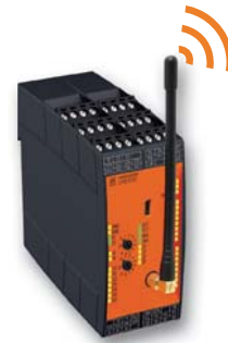
Radio controlled safety module UH 6900