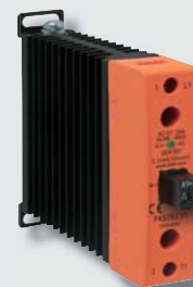
Solid-state contactor PK 9260

Like all solid-state switching devices, the solid-state contactors also impress with their narrow and space-saving design. Thanks to the pre-dimensioned heat sink, the devices can easily be snapped onto a DIN rail or mounted on carrier plates using fastening screws.