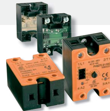
Solid-state relay PH 9270

Fast commissioning Flexible wiring and fast commissioning as well as simple snap-on option on DIN top-hat rail