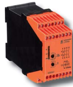
Standstill Monitor LH 5946

Cat. 4 / PL e according to DIN EN ISO 13849-1 SIL CL 3 according to IEC/EN 62061 SIL 3 according to IEC/EN 61508, IEC/EN 61511 and EN 61800-5-2