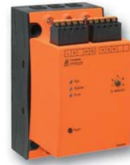
Softstarter PF 9029