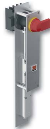
SAFEMASTER STS Power Interlocking ZRH01SLPR40