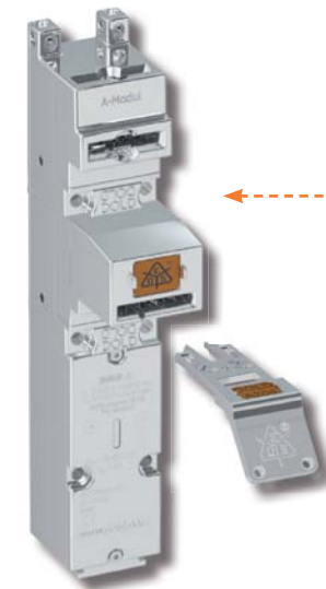
Example: STS-Unit SX01A