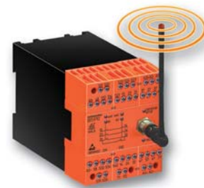
Wireless safety module BI 5910

Safety Integrity Level (SIL 3) in accordance with IEC/EN 61508