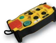
Handheld transmitter RE 5910