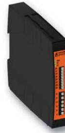
Emergency stop module UF 6925