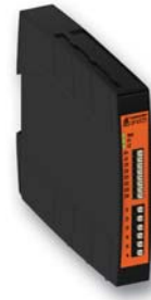
Emergency stop module UF 6925