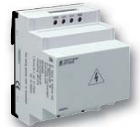
Coupling device RP 5898