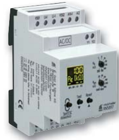
Insulation monitor RN 5897