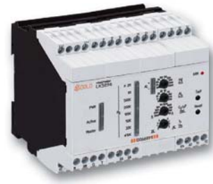
Insulation monitor LK 5896/900