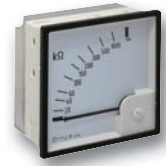
Indicating instrument RP 5898