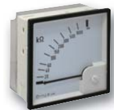
Indicating instrument RP 5898