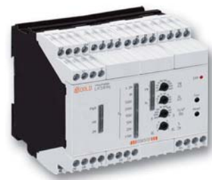
Insulation monitor LK 5896