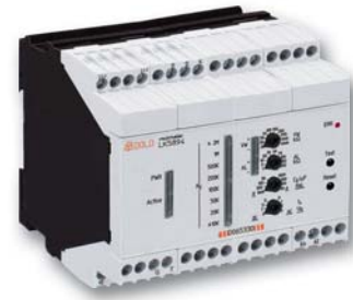
Insulation monitor LK 5894