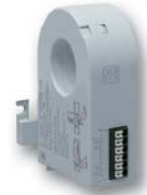
Residual current transformer ND 5015