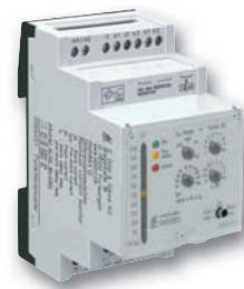
Residual current monitor RN 5883